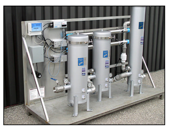
In effect, a clean, corrosion-free delivery system is restored and maintained in an environmentally safe and chemical-free manner. The result is clean water, pipes and tubing with no biofilm and bacterial contamination.

The real value of the Integrated System design is our ability to custom tailor the system for any specific use. Based on water quality data and flow rate requirements the system will process the required volume of water to meet public health standards for drinking water quality. The product water will be free of common bacteria, viruses and other disease causing pathogens.